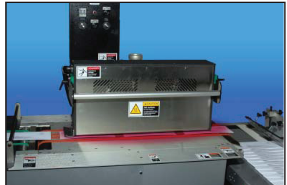
Specially designed bulbs reduce glare and direct most infrared energy towards the ink pattern. This means lower power settings can be used, reducing energy consumption and extending bulb life.