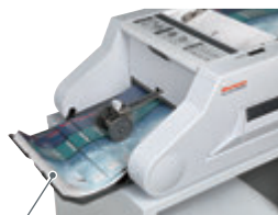
Folded sheets are neatly stacked on the delivery conveyor.

Unique drive control system is used for quieter operation at higher production speed (251 sheets per minute with A4 / 8.5" x 11" single fold).